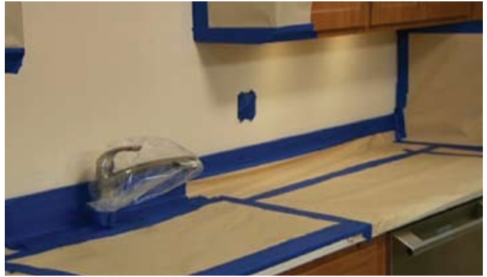
Carefully prepare the work area before setting tile.