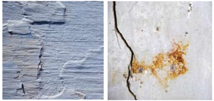
SPRAY & SET™ Adhesive is not for use on damaged walls.