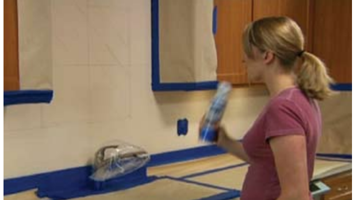
Shake the can well before use.