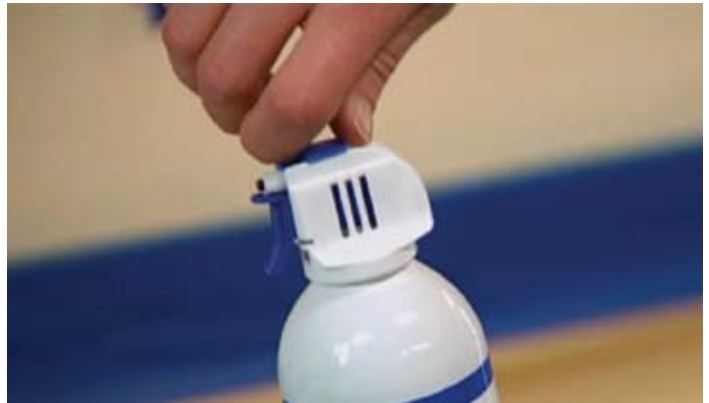
Be sure to remove the safety tab before spraying.