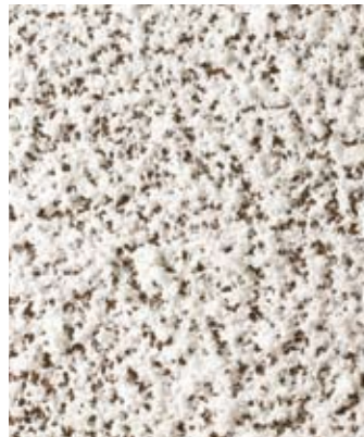
Immediately after spraying.

SPRAY & SET™ Adhesive is ideal for ceramic and porcelain tile, and can also be used with mesh-backed tile.