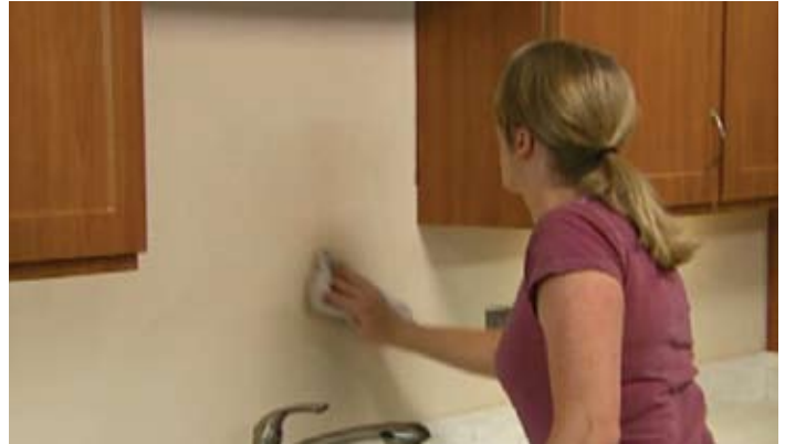
Walls must be clean and dry before setting tiles.