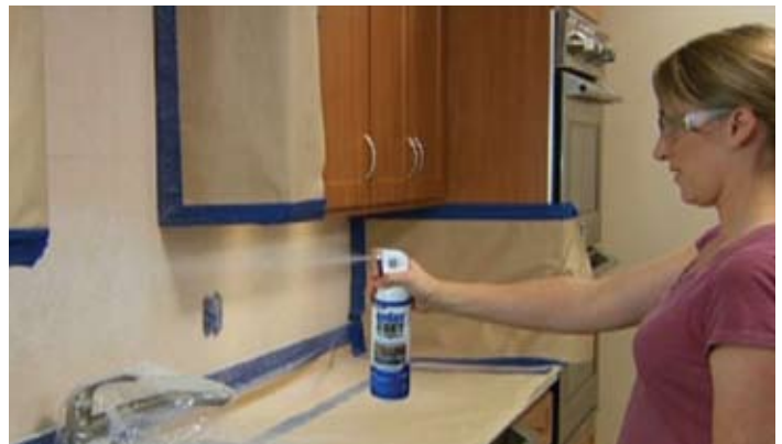
Be sure to hold the can 18" to 24" from wall when spraying.