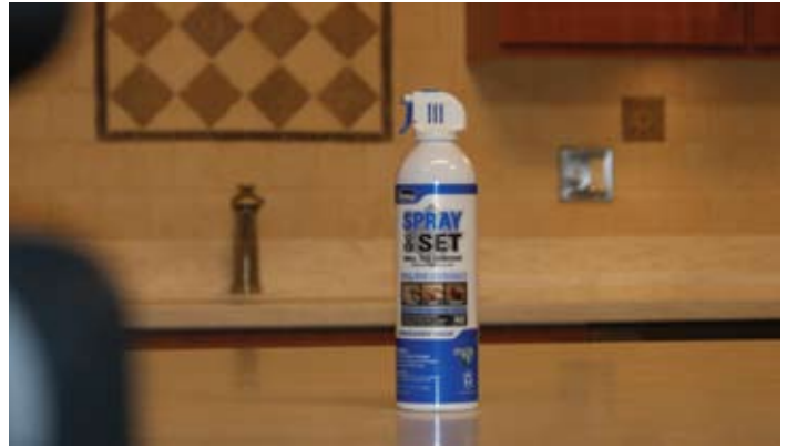
Now, you can start and finish tiling jobs in just one day.

Call 1-877-235-9733 or e-mail custsvc@sprayandset.com