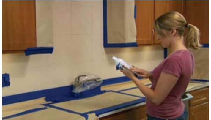
Be sure to read all directions twice.