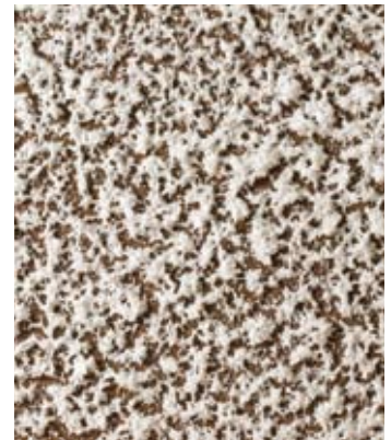
30 minutes after spraying.

This is what a properly sprayed wall will look like immediately and after 30 min.